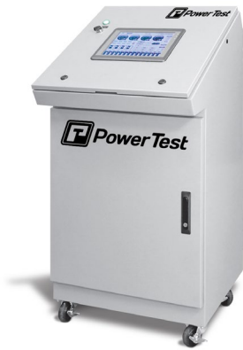
ASC Shift Console shown