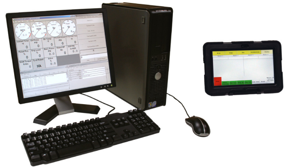
63249 - PowerNet CD Computer System and Handheld Controller Shown

Power Test PowerNet CD system includes four (4) temperature sensors and four (4) pressure sensors. Information from these sensors and the torque, rpm and power measurements from the dynamometer are automatically recorded to the Commander computer's hard drive.