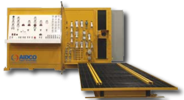
Model 900C with worktable

Each AIDCO Hydraulic Test Stand is custom built to your exact specifications