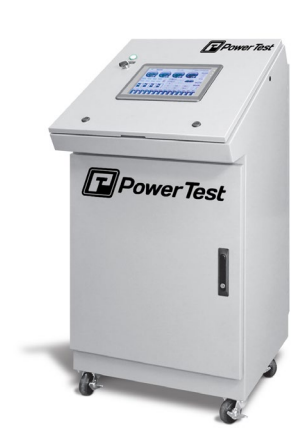
ASC Shift Console shown