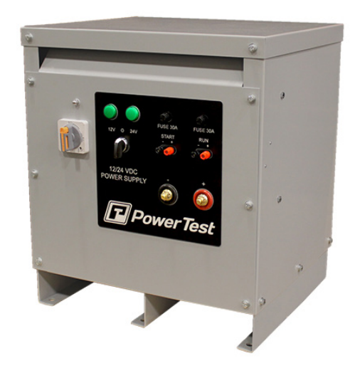
1034217 DC Power Supply shown