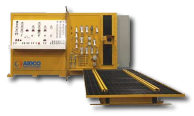
Model 900C with worktable

Each AIDCO Hydraulic Test Stand is custom built to your exact specifications