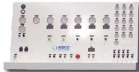
Gauge and Pressure Tap Panels

Each AIDCO Hydraulic Test Stand is custom built to your exact specifications