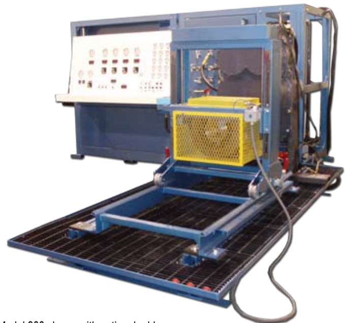
Model 900 shown with optional eddy current load absorber and stand

In addition to the Model 900 Hydraulic Test Stand, AIDCO manufactures a wide range of transmission testing equipment, including electronic shift consoles, valve body test stands, and transmission test stands.