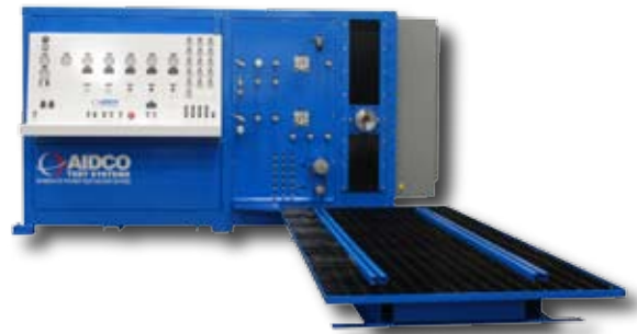
Model 900 with worktable

Each AIDCO Hydraulic Test Stand is custom built to your exact specifications